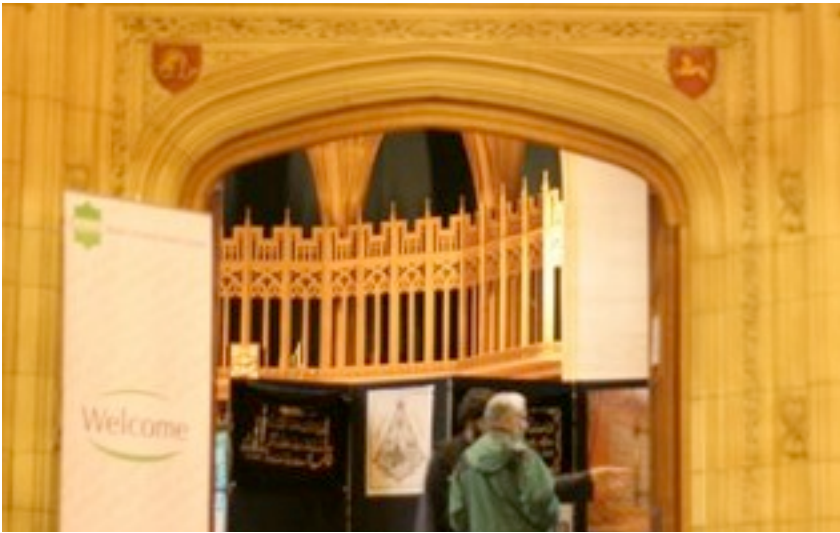
Entrance to our Islamic Heritage and Arts Exhibition 2007.